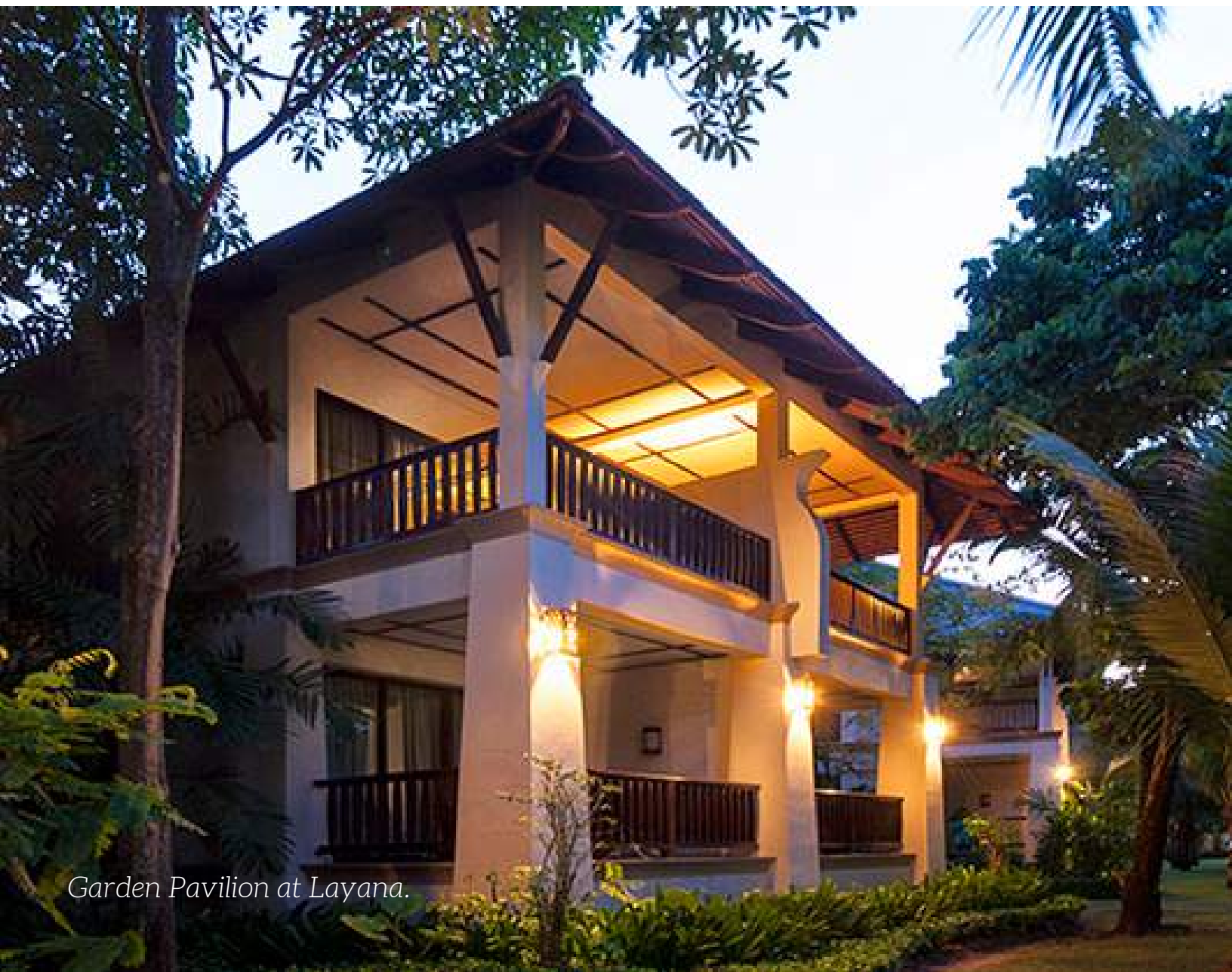
Garden Pavilion at Layana.