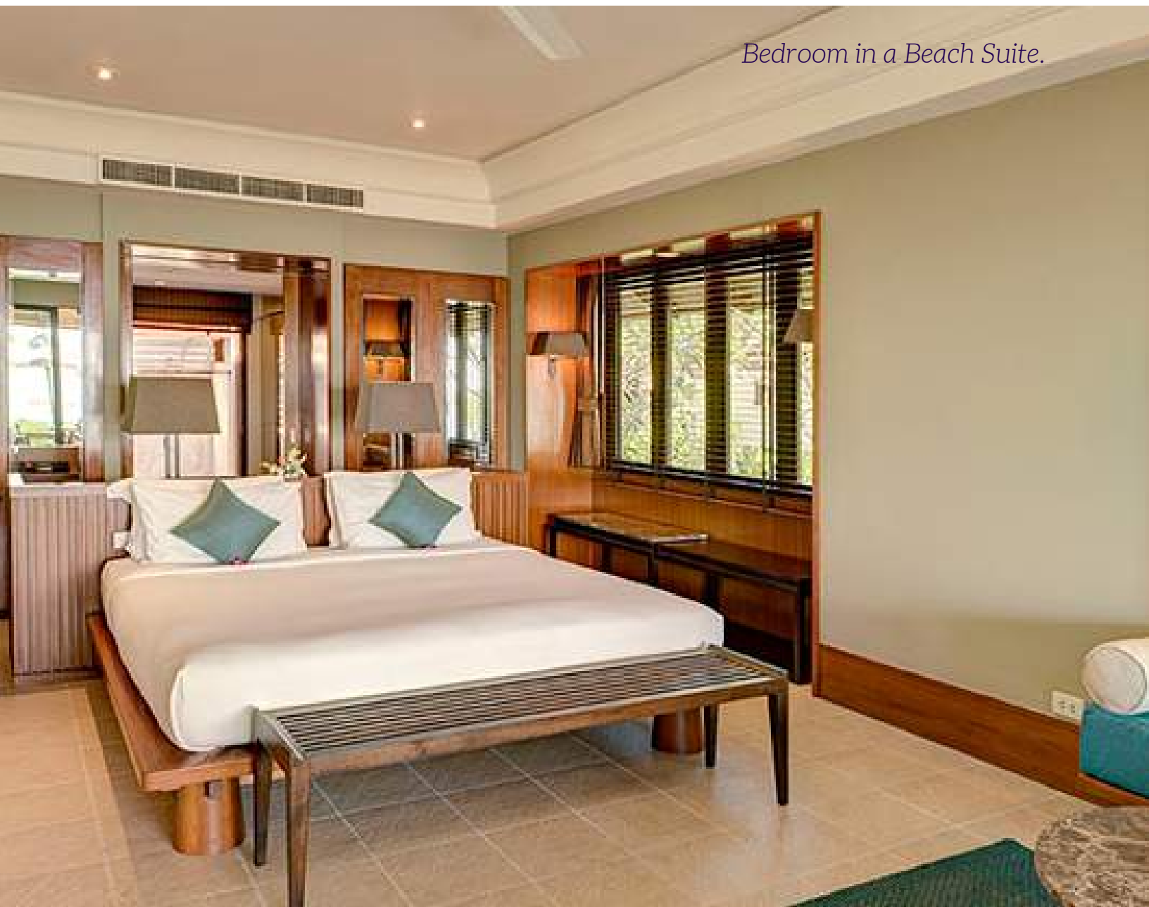
Bedroom in a Beach Suite.